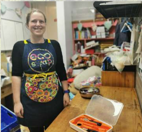
Left: Ecoswap (a refillery, eco and preloved shop).

TRACOUk and ACTION HAMPSHIRE collaborate to launch the Sustainable Future Fund, supporting local artisans and furniture makers in the circular economy.