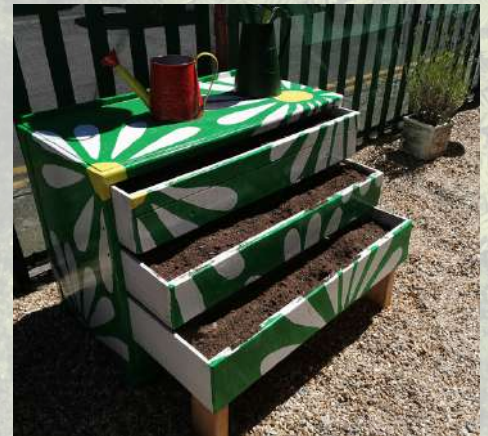
Right: Fabshab (A 'dream team' of 2 artisan/furniture makers saving the everyday items one piece at a time!)